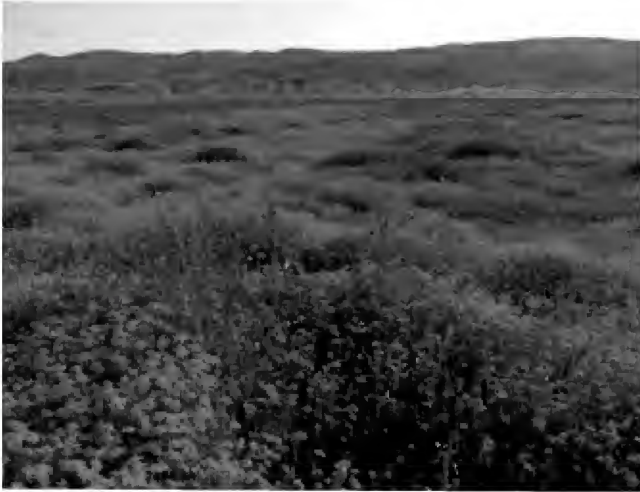
Field of Monolopia lanceolata and Amsinckia , Carrizo Plain National Monument.